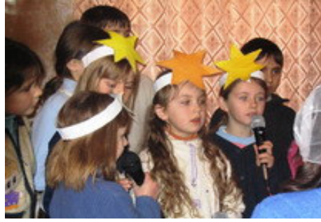
Our children in the church ministry