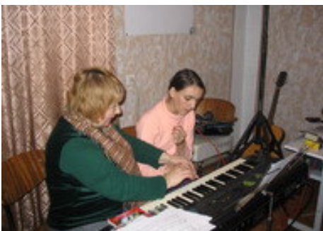
Learning to play keyboard. (Keyboard is a gift one of the churches in Norway)