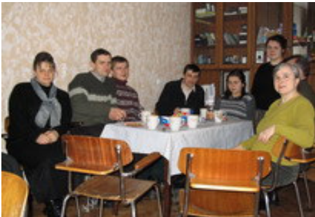
Every Sunday after the church meeting small cafe at work