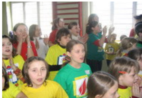
Kids cheering for partakers of sports competition