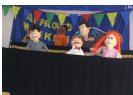
One of the teams in the creative part showed a puppet theater