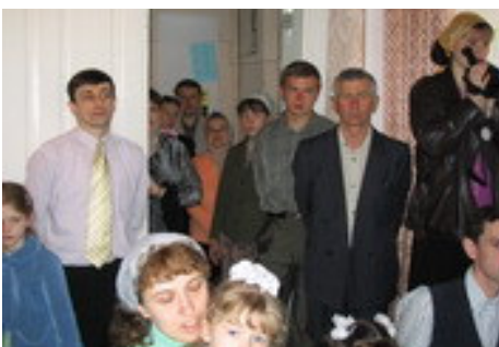
Some times we have too many people at the meeting and some people need to stay in the corridor.