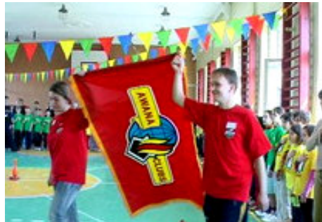
AWANA The participants caring a flag