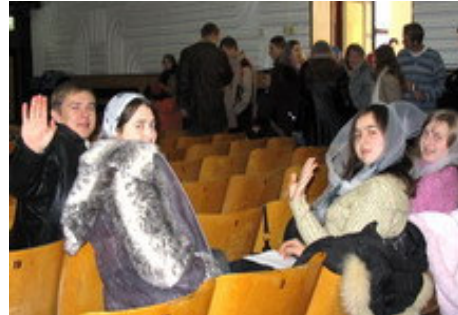
Our youth at the conference in Novovolinsk