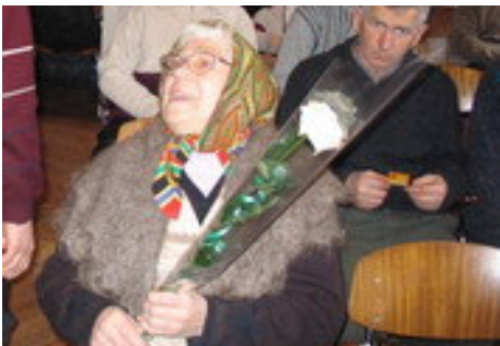
At one of the meetings our young people gave the flowers to our seniors, buy saying We love you and appreciate you work for the church