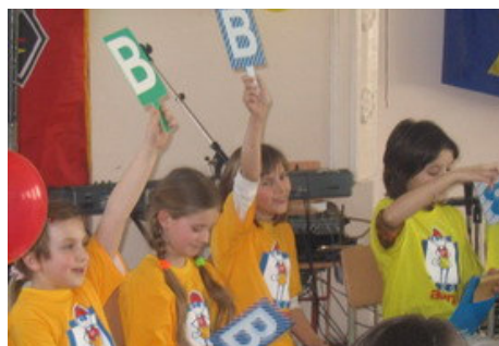
Questions answers Bible competition