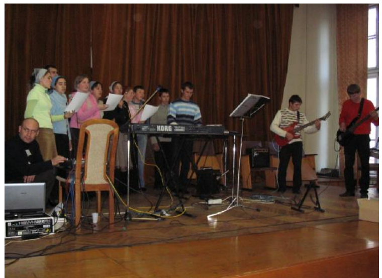
Guests from the church of c. Vinnitsa. In the order to get to a festival they needed to ride about 400 km