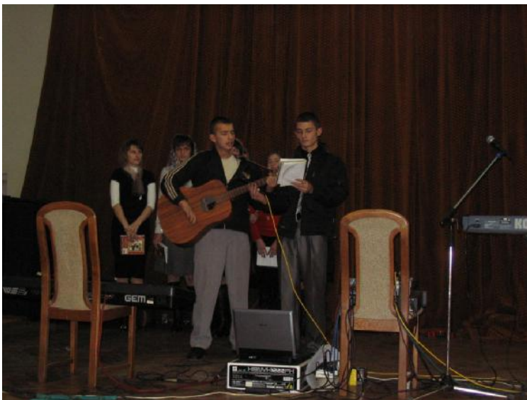
Guests from a city Novovolinsk.