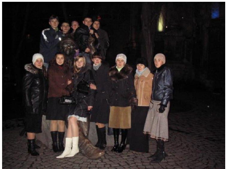
Group of young people from c. Vinnitsa remained, to take part in Sunday service of church Smyrna . After a festival we went for excursion to see Lviv at the evening.