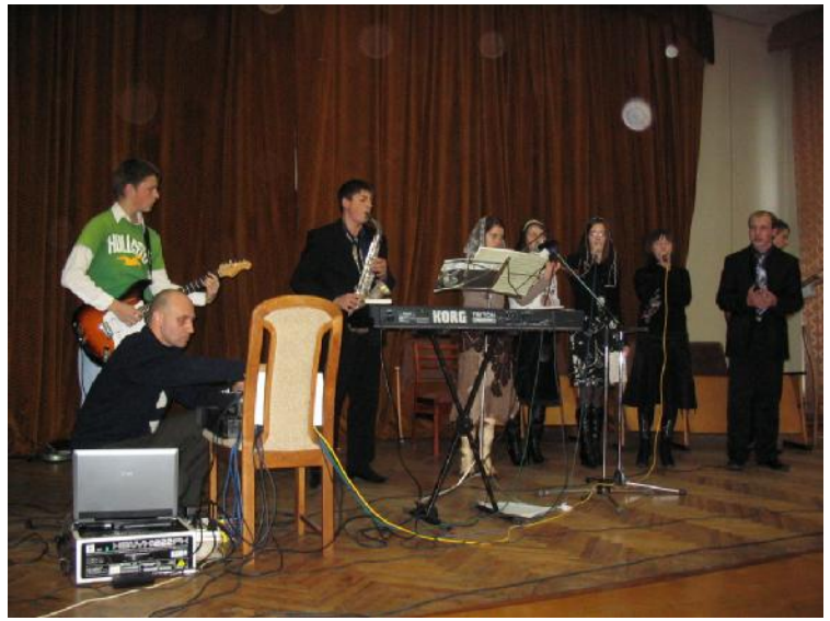
Youth from a brotherly church m. Berdichiv.