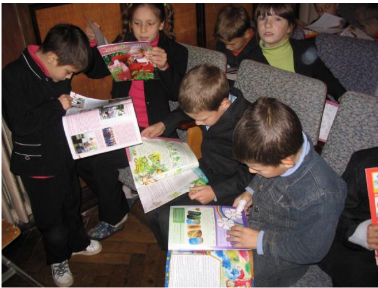
Kids from boarding-school read magazines with fascination. That had the special value that these magazines are not general, not taken in a library, but personally their.