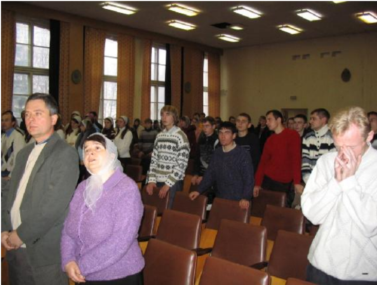
Everybody glorify God in songs.