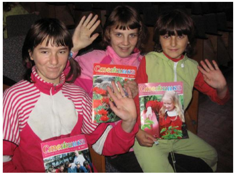
Kids didn't want us to leave and they wanted to know, when we will come again? Saying goodbye said: see you soon.