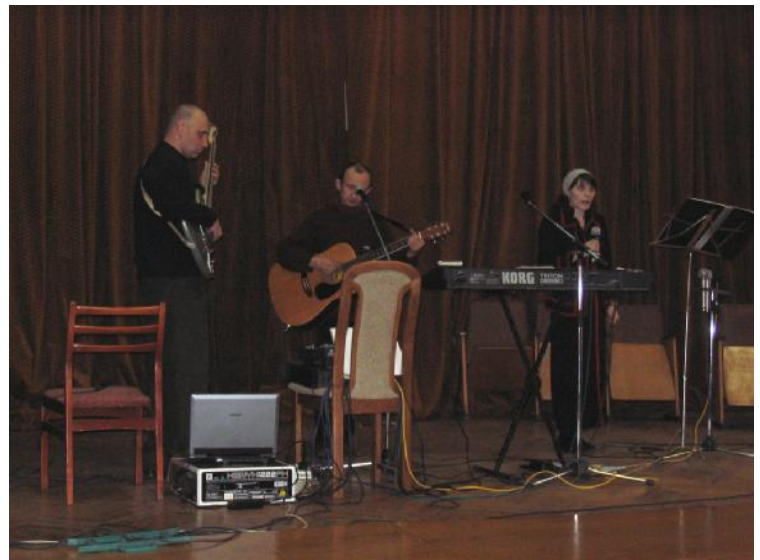
Musical group the Clean sources /church Smyrna /, was on rights of owners.