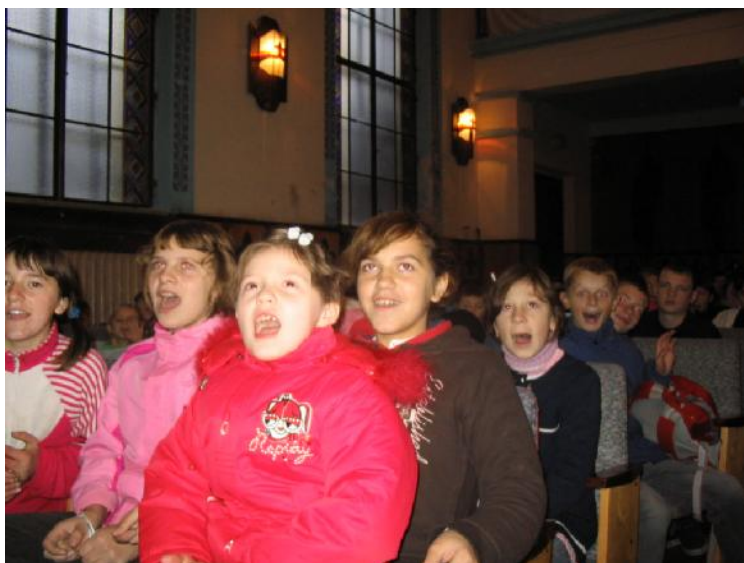
Kids were not only listeners but also by the participants of the festive program, sang, played games, and answered a question.